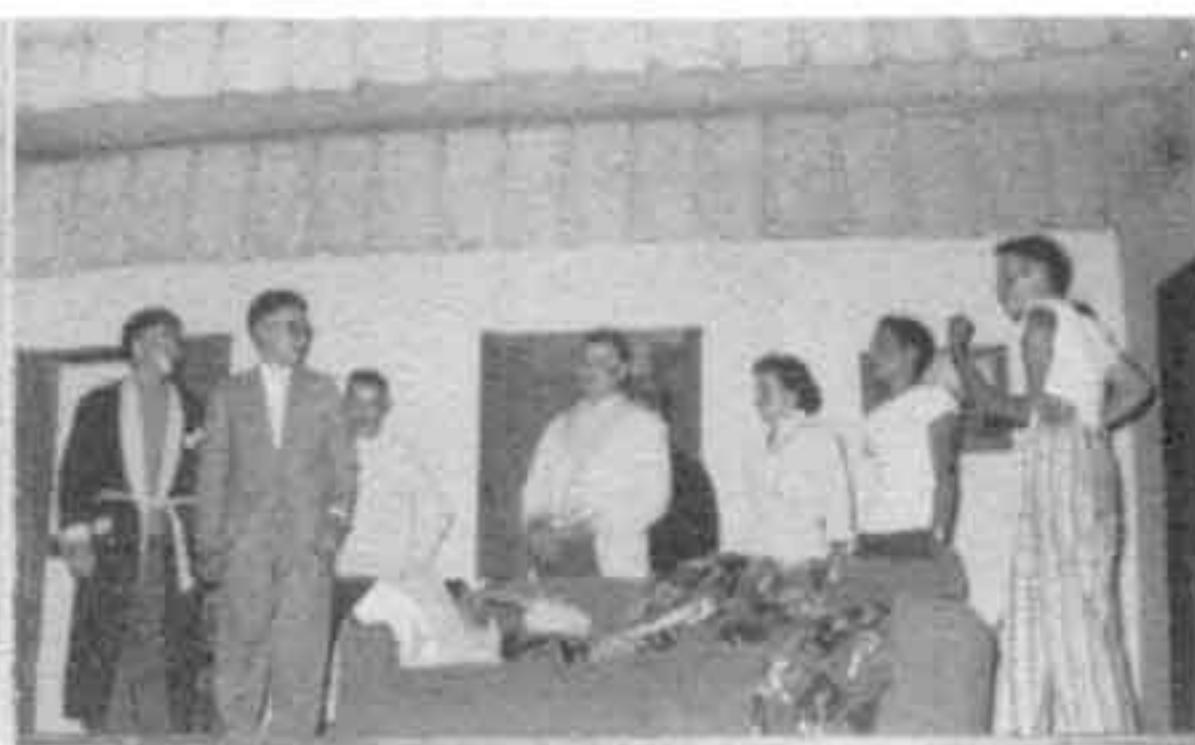
It's three o'clock in the morning!