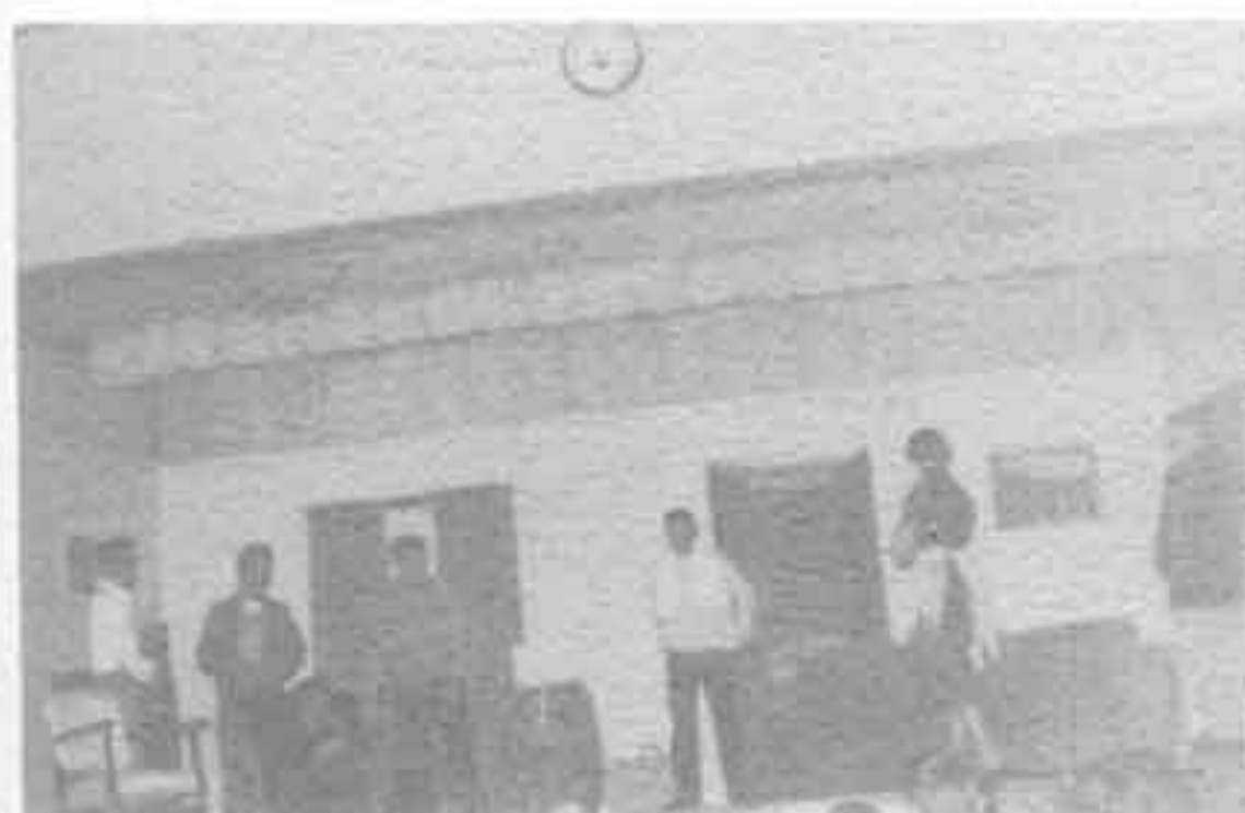
Who's the guilty one?