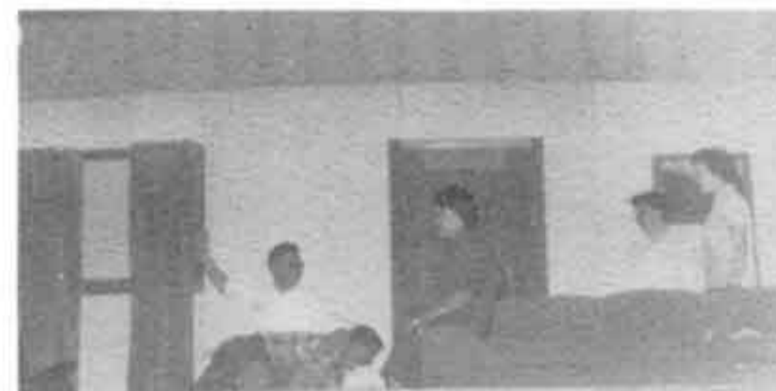
Ow, it hurts!