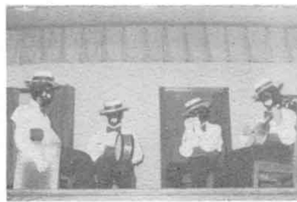
Who's making with the noise?