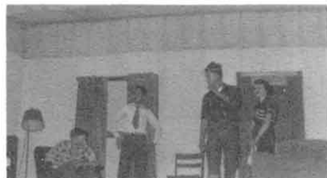
What's up Doc?