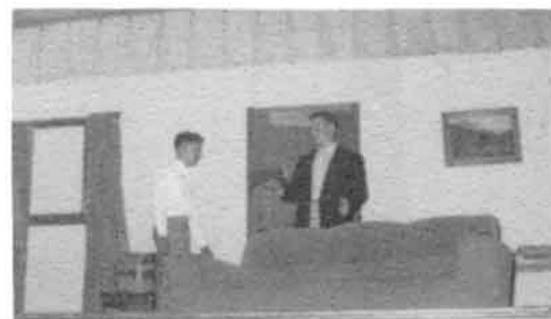
It's a fact!