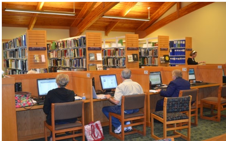
Researchers at Helen Warner Branch Library Genealogy Lock In.