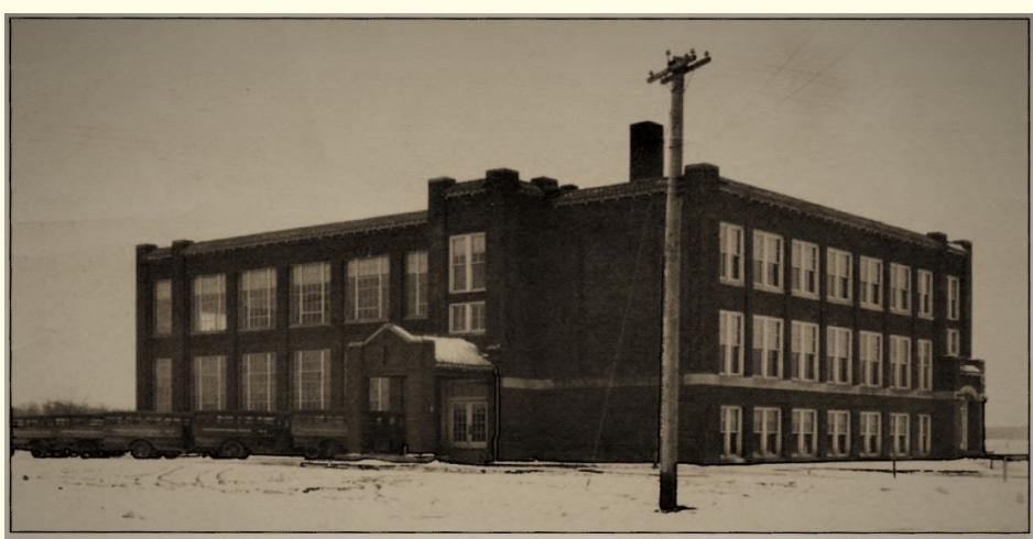
The quality of education received in rural one-room schools varied greatly depending on the resources of the community, and some graduates from eighth grade found entry into an area high school difficult. By 1920, Okemos followed the statewide trend of consolidating area schools into one central location to combine resources. The above photograph is of the Okemos consolidated school at the corner of Okemos and Mount Hope Roads. School buses were introduced to transport students living in far corners of the district.

Okemos Consolidated school, which sits on a hill overlooking the river valley, is a fully accredited institution, offering the full 12 grades. One school building on the north side of the river houses the first